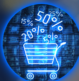
Discounted Events & Hard Copies