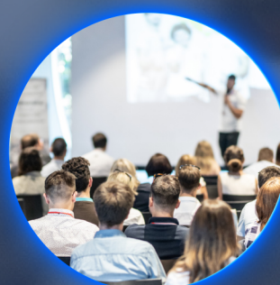
Seminars & Webinars