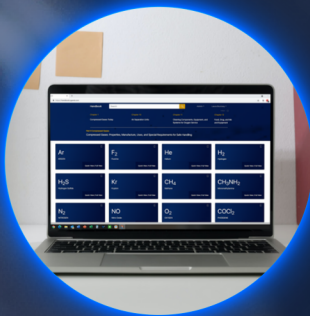
Handbook of Compressed Gases